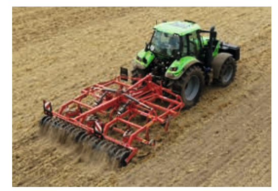
Stubble cultivators Enduro/Enduro Pro, CLC and CTC