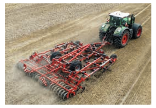
Stubble and seedbed cultivators Turbo and Turbo T i-Tiller