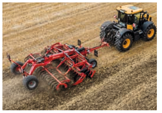
Short disc harrows Qualidisc Farmer and Qualidisc Pro