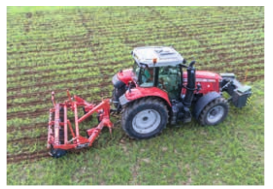
Subsoilers CLI, DTX and Flatliner for loosening soil compaction