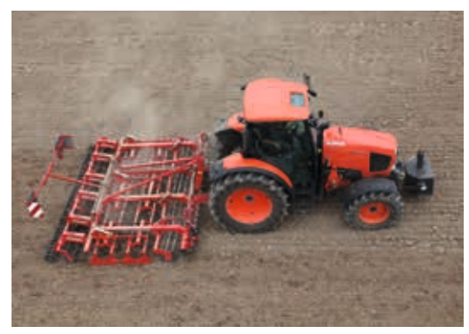
Seedbed harrows TLD and TLG