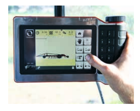
Smart farming technologies for increased efficiency and operator convenience.