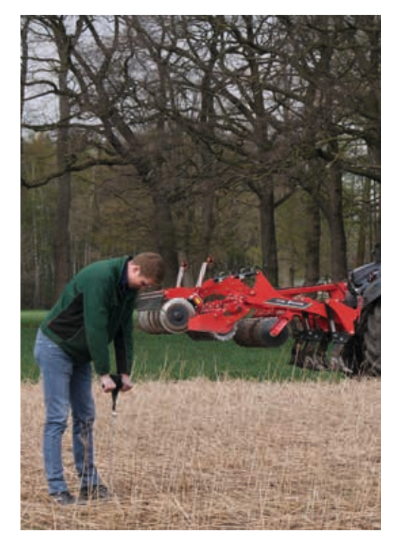
Listening to the farmers' needs – creating new innovations

You need solutions that make tough and demanding conditions less complicated.