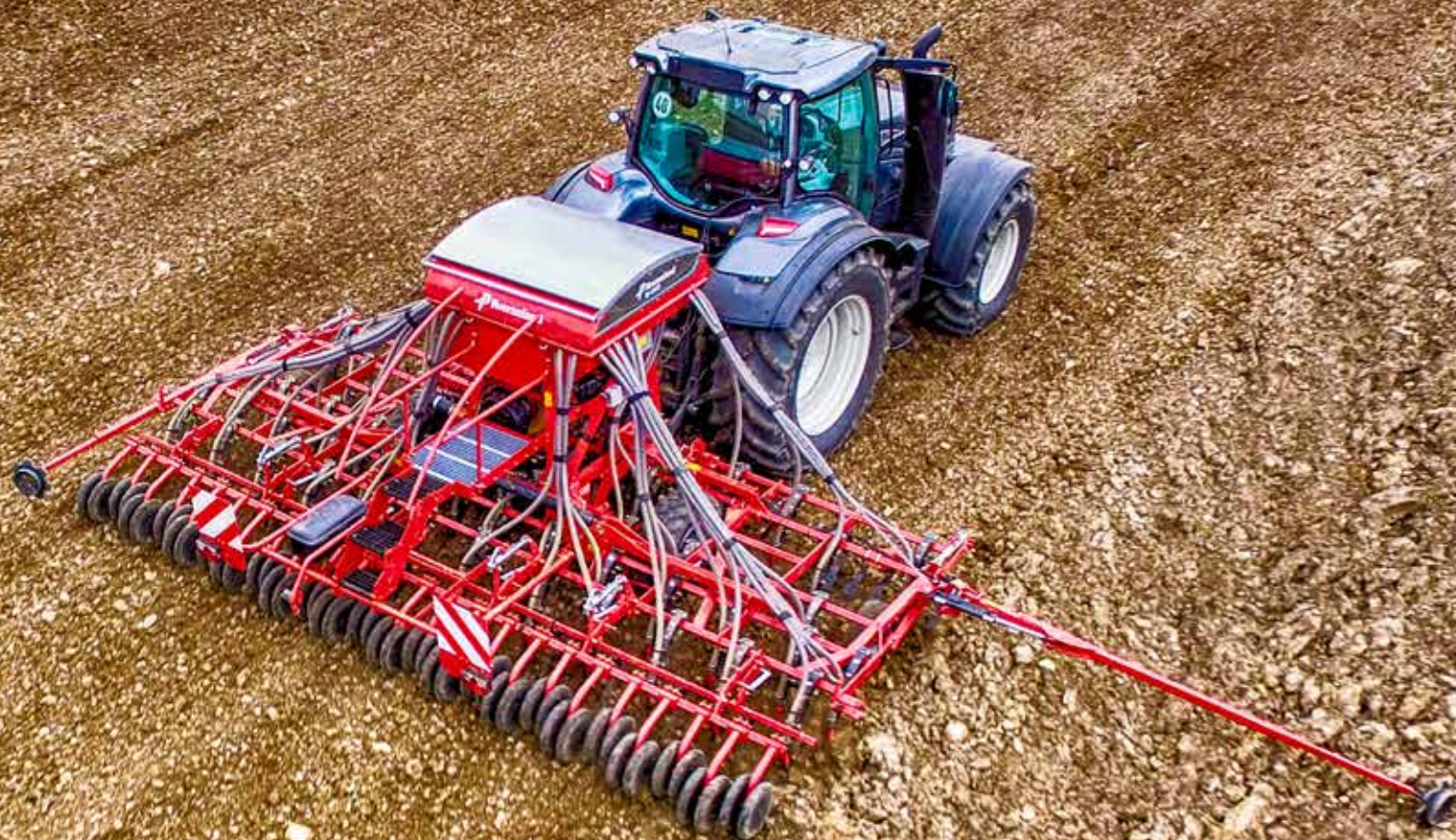
TS-DRILL TINE SEEDER