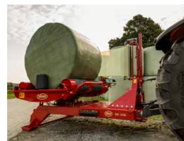
Able to handle round balers up to 1200 kg.