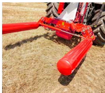
Easy and gentle self-loading of the bales – the bale is gently lifted by the rollers.