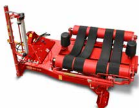
Vicon BW 2100 Turntable wrapper, mounted Max bale size: 1.20x1.50m