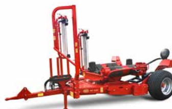
Vicon BW 2600 Turntable wrapper, trailed Max bale size: 1.20x1.50m