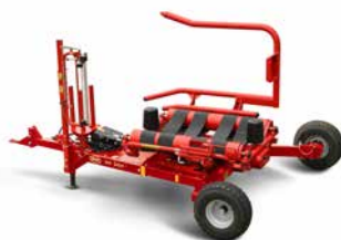
Vicon BW 2400 Turntable wrapper, trailed Max bale size: 1.20x1.50m