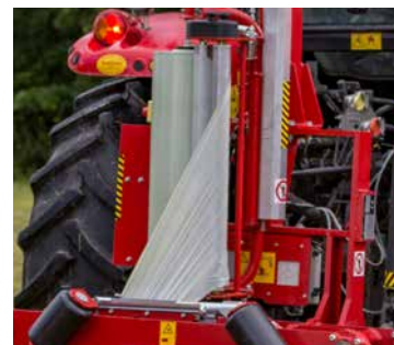
Hydraulic film cutter.