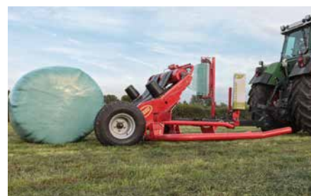
Low design of the machine ensures fast and gentle unloading of the bale.