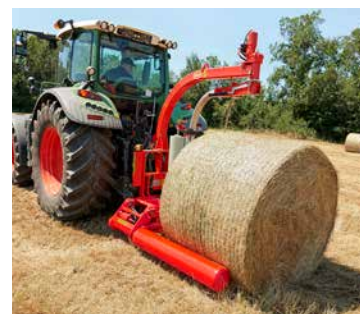
The BW 2250 has a self-loading mechanism to gently load and unload the bales.