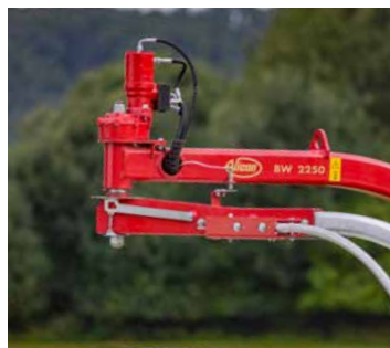
Strong satellite driveline.