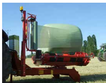
Bale and wrap counter is standard.

“Optional remote control – for easy handling”