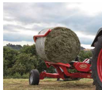
Hydraulically operated loading arm, and a low loading height, provides fast transfer of bale from arm to turntable.

The clever design of the frame with its extendable wheel arm on the right hand side allows an increase in track width on the field for maximum stability during loading of bales. The hydraulically operated loading arm is positioned on the right hand side and can handle bales up to 1000 kg with 1.20m up to 1.50m diameter.