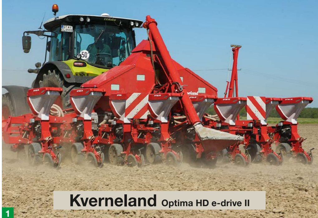
Kverneland Optima HD e-drive II

in a slight curve to prevent it from rolling. The same tube is used to empty the seeders into a tray. Excellent. Optima was the only machine that had two strippers, of which however only the top one usually needs adjusting. A Plexiglas inspection window allows the operator to check easily whether all cells are filled properly.