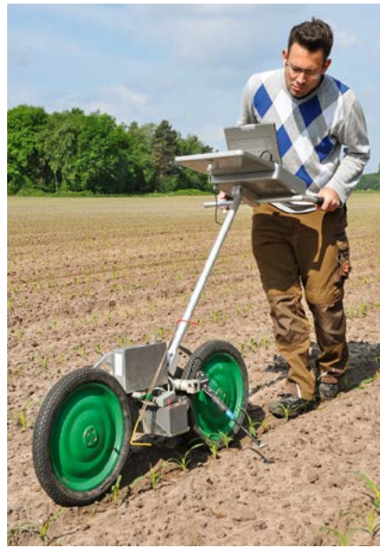
The DLG Test Center measured for us the crop spacings in the field.