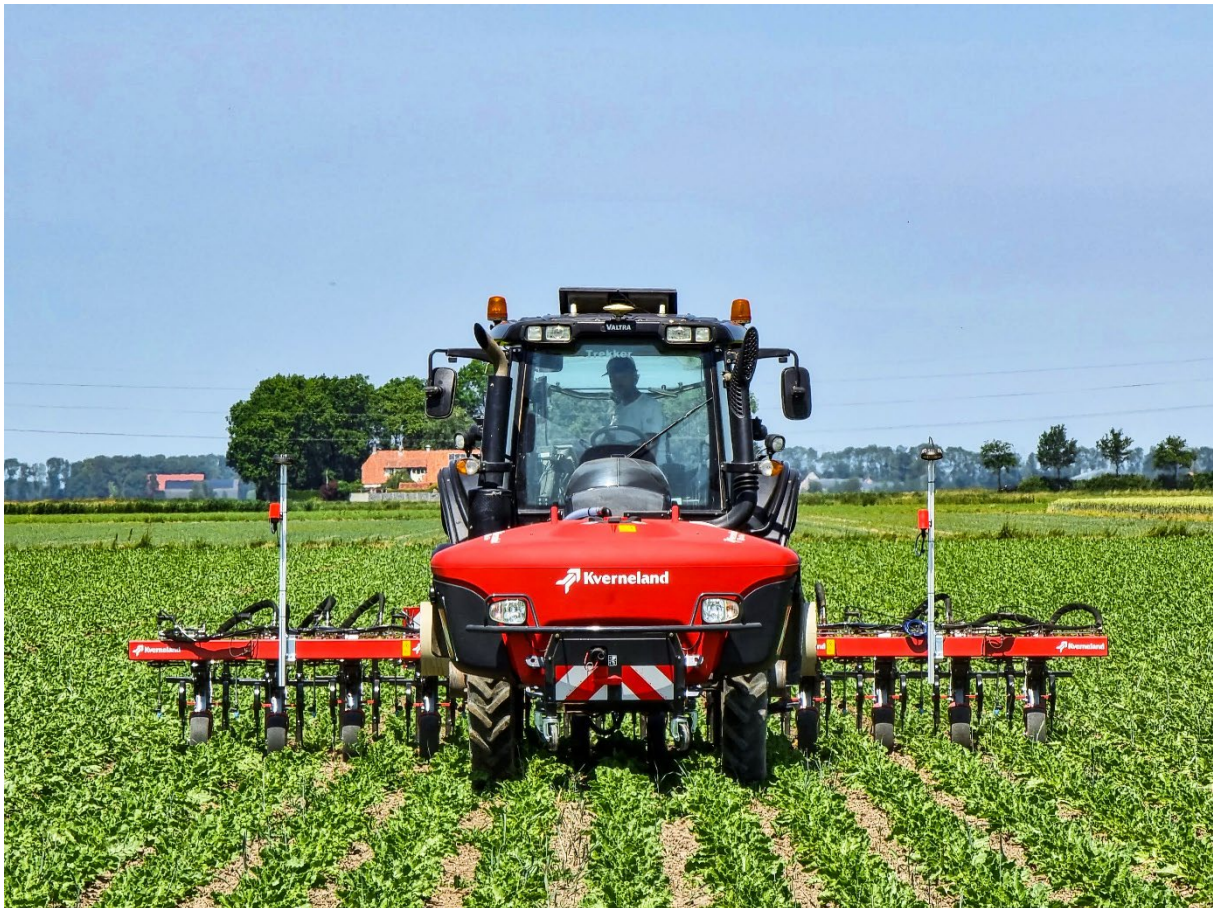
Combined systems in development: here Kverneland Onyx with iXtra LiFe

In order to extend application possibilities, Kverneland combines systems of mechanical weeding with chemical crop care and fertiliser application: