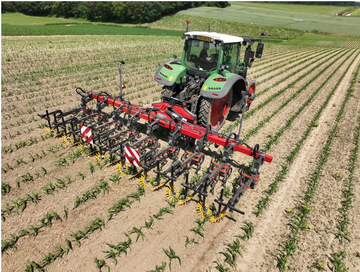
Kverneland inter-row-cultivator Onyx with guidance interface Lynx